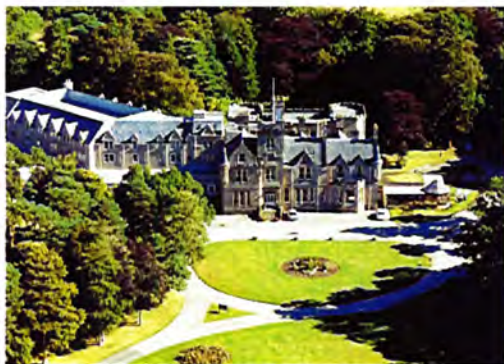
The Newton Hotel Inverness Road NAIRN