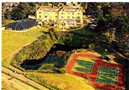
The Golf View Hotel Seabank Road Nairn

The two hotels are about 800 yards apart.